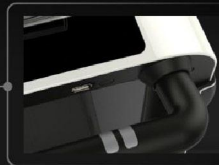
USB charging port