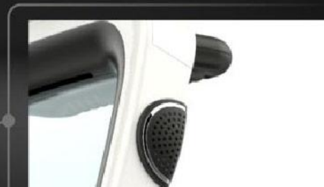
3D surround sound